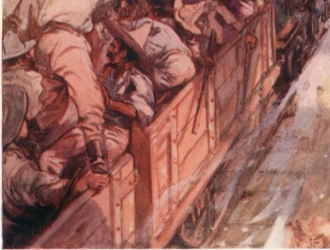
THE RACE TO THE SWIFT