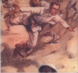
A SCRIMMAGE AT RAILHEAD