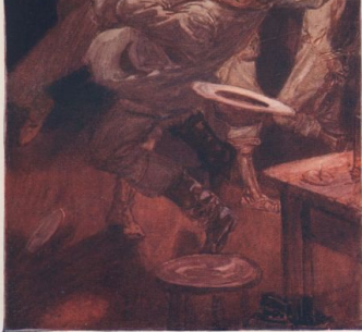
ASSAULT AND BATTERY